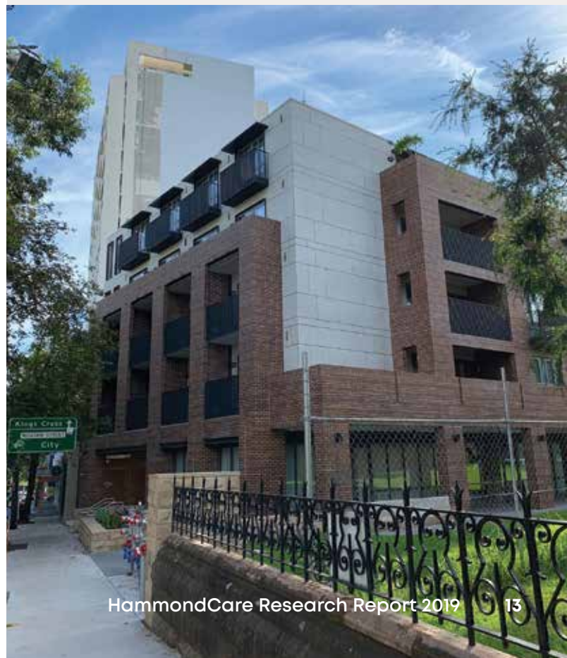
Pictured: HammondCare Darlinghurst

This model of care will also take into account both health needs (such as mental health, substance dependence and acquired brain injury) and significant losses through the life course of people who have experienced homelessness.